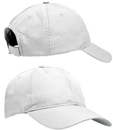
Unisex Cap White One Size Fits All