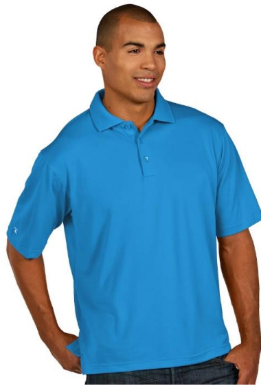
Men's Polo Columbia Blue Available Sizes: S – XXXL