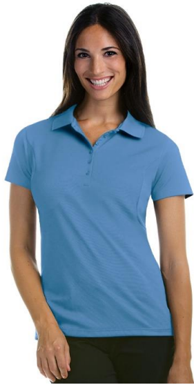
Women's Polo Columbia Blue Available Sizes: S – XXL

100% polyester Desert Dry™ Xtra-Lite D²XL moisture management pique short sleeve polo with flat knit collar & open sleeves.