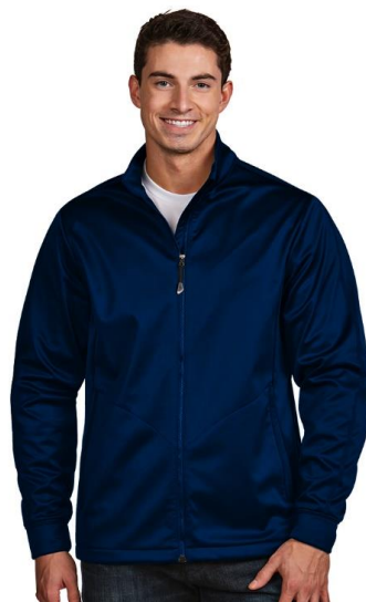
Men's Polo Navy Blue Available Sizes: S – XXXL